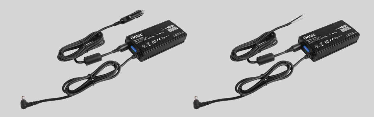
Cigarette Lighter Plug Version

(Cigarette Lighter Plug Version) GAD2X8 (Bare Wire Version)