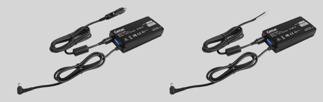
Cigarette Lighter Plug Version

(Cigarette Lighter Plug Version) GAD2X8 (Bare Wire Version)