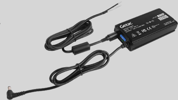
Bare Wire Version