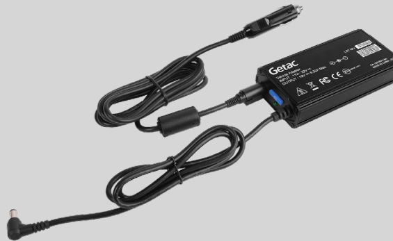
Cigarette Lighter Plug Version