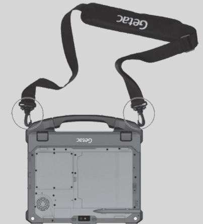
Attaching to the Detachable Keyboard