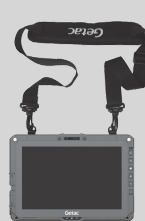
Attaching to the Tablet